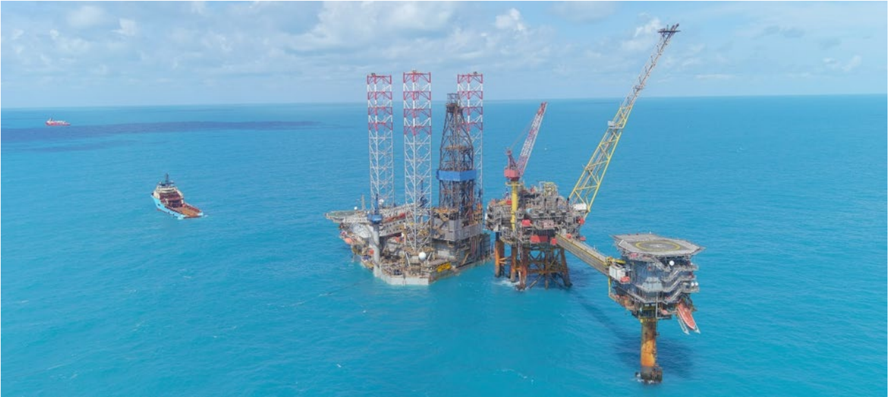
The rig Shelf Drilling Winner alongside the Harald platform to drill the Harald East Middle Jurassic Well